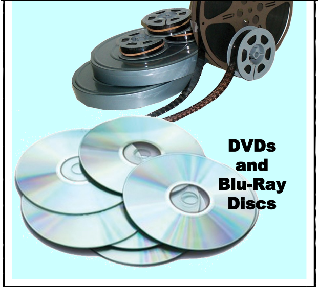
DVDs and Blu-Ray Discs

Save 20% on these prices February 1st through March 28th, 2024